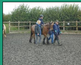
Treetops Enjoying a boat trip!